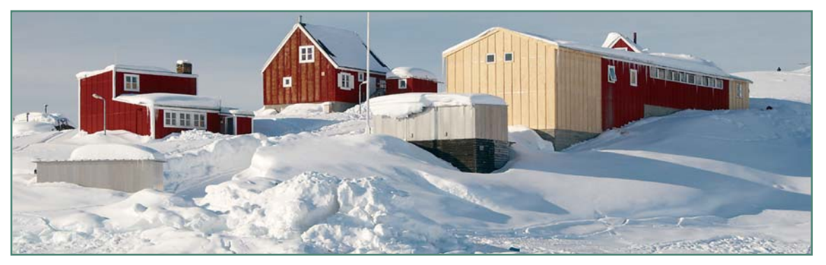
A guide to research and ethics information is also available at <a href="http://www.naho.ca/inuit/e/ethics">http://www.naho.ca/inuit/e/ethics</a>

http://www.hc-sc.gc.ca/sr-sr/advice-avis/reb-cer/index_e.html